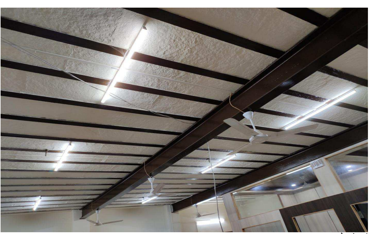
LED Sample Photo