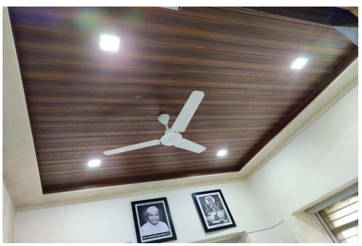
LED Sample Photo