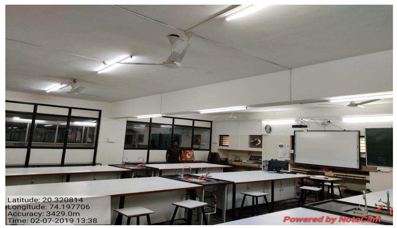
LED Sample Photo